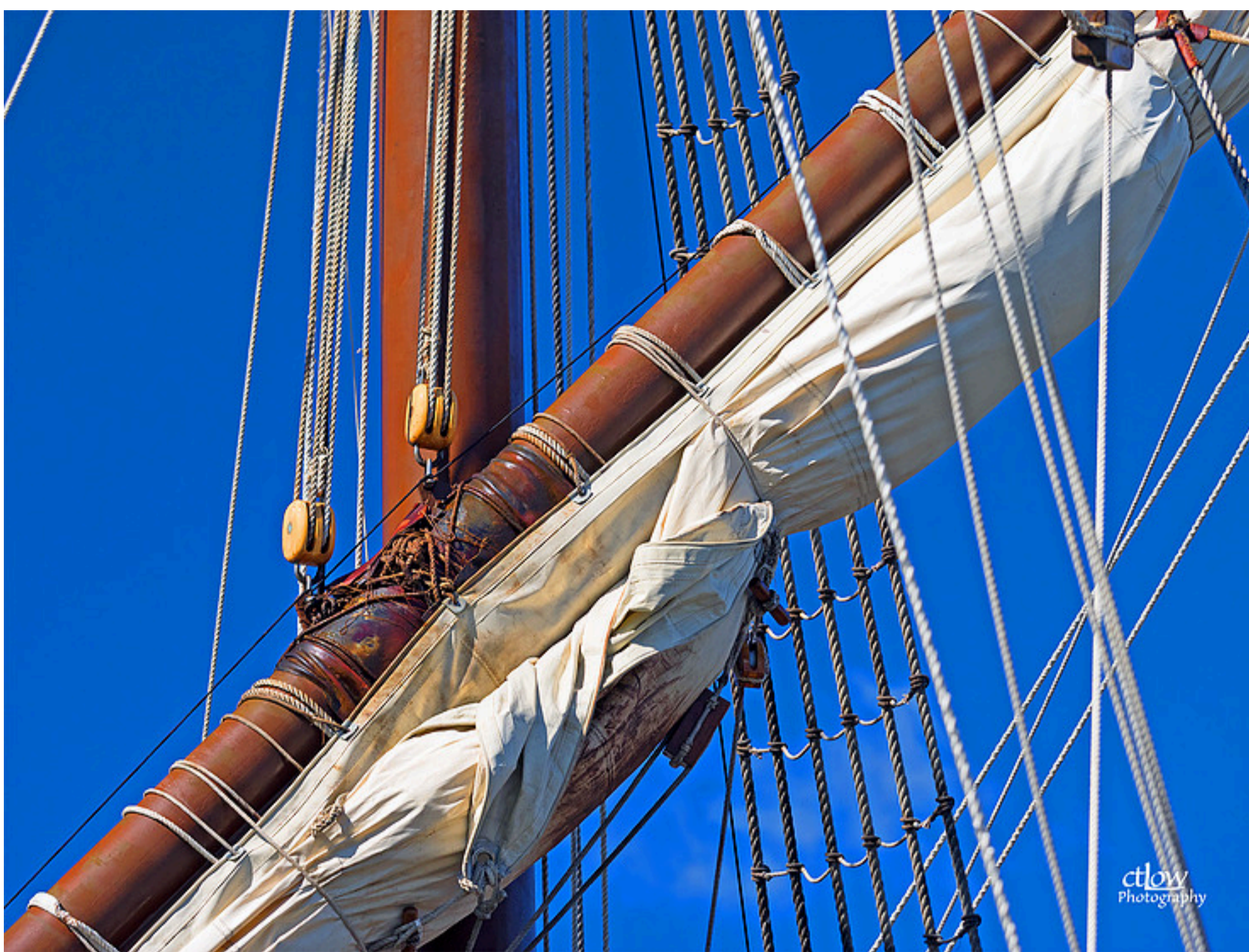
Nao Santa Maria yardarm

Below, Empire Sandy , a tour-boat from Toronto, cuts a fine sight out on the water.