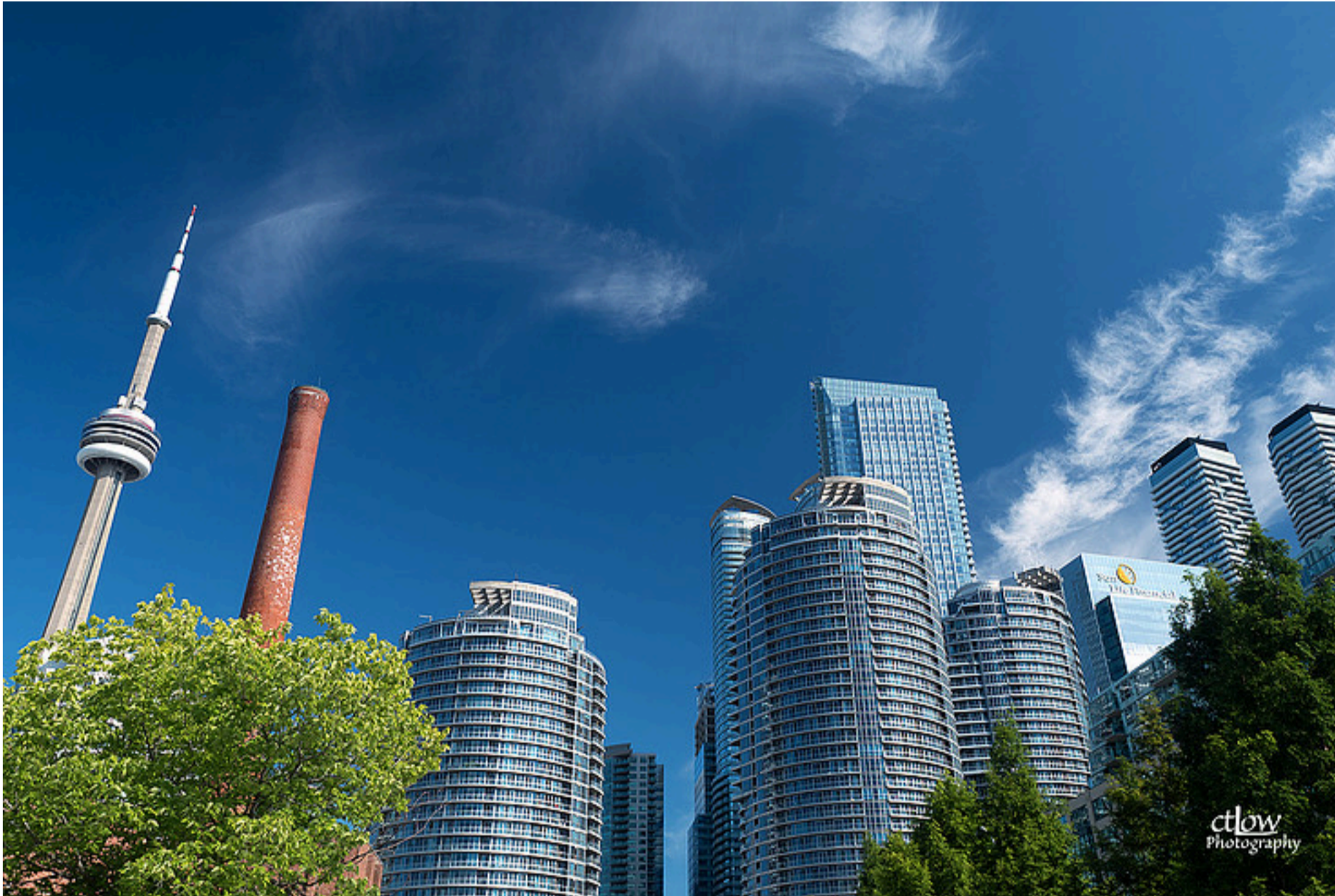
Toronto Harbour skyline, CN Tower

Ask me about those technicalities sometime. It resulted in the following: