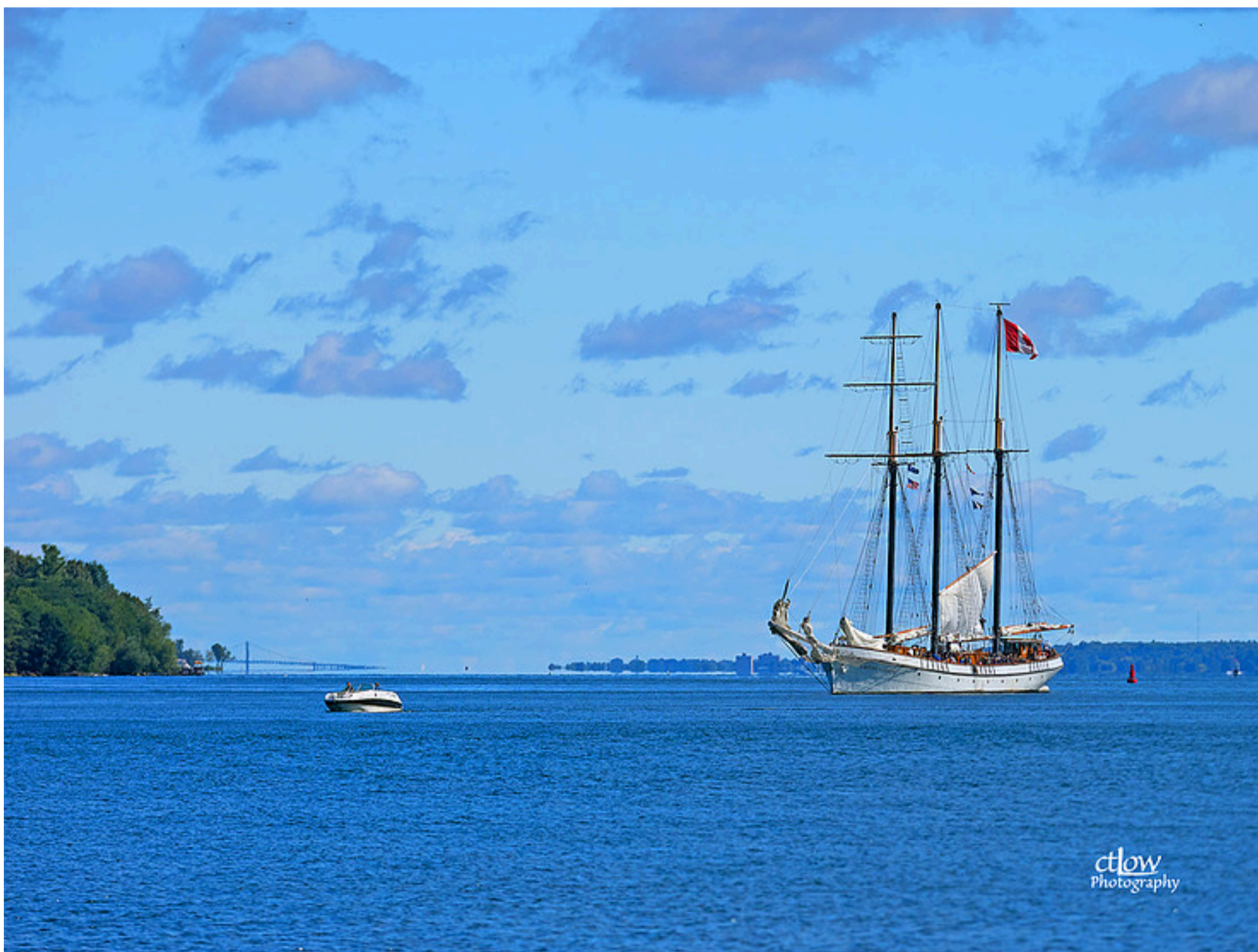
Empire Sandy at Brockville Tall Ships Festival

Below, Empire Sandy , a tour-boat from Toronto, cuts a fine sight out on the water.