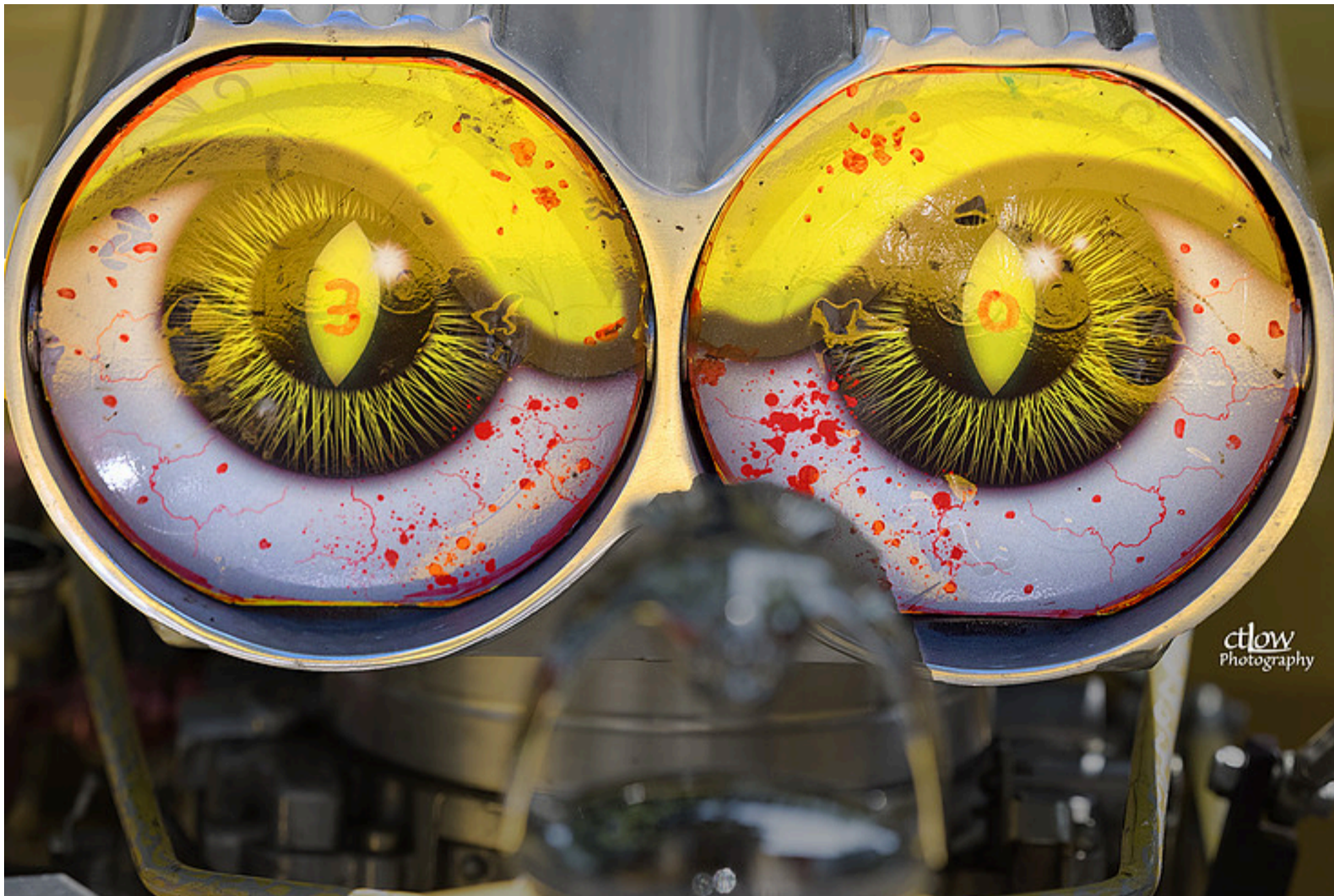
Engine air-intake eye-art

This annual car-show in Brockville never fails to amaze. This year I seem to have homed in on details, like this air intake.