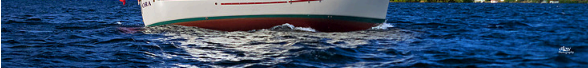
Temora - 30 foot heavy-duty cruising sailboat for sale

He got his photographs, seems pleased (I feel pleased), and if you're in the market for a heavy-duty, 30-foot (gorgeous) cruising sailboat, then I know a guy.