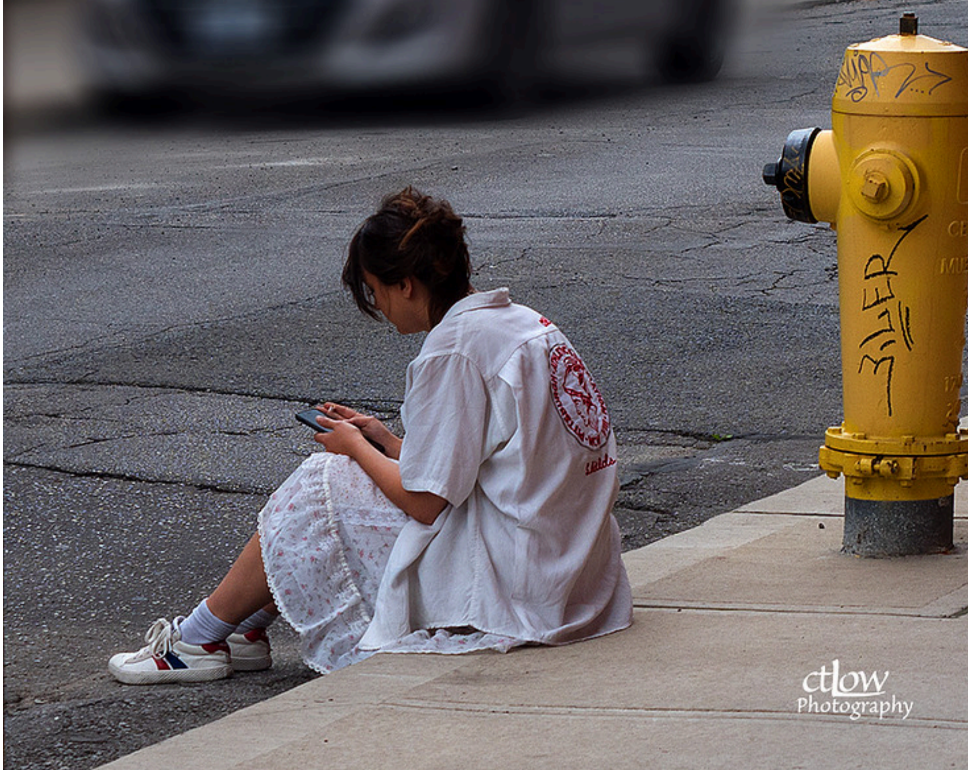
Young woman on curb on work-break

My companions were endlessly patient with my photography, and for the image below I just had to walk twenty steps off our route to avoid some urban wires, and I snapped.