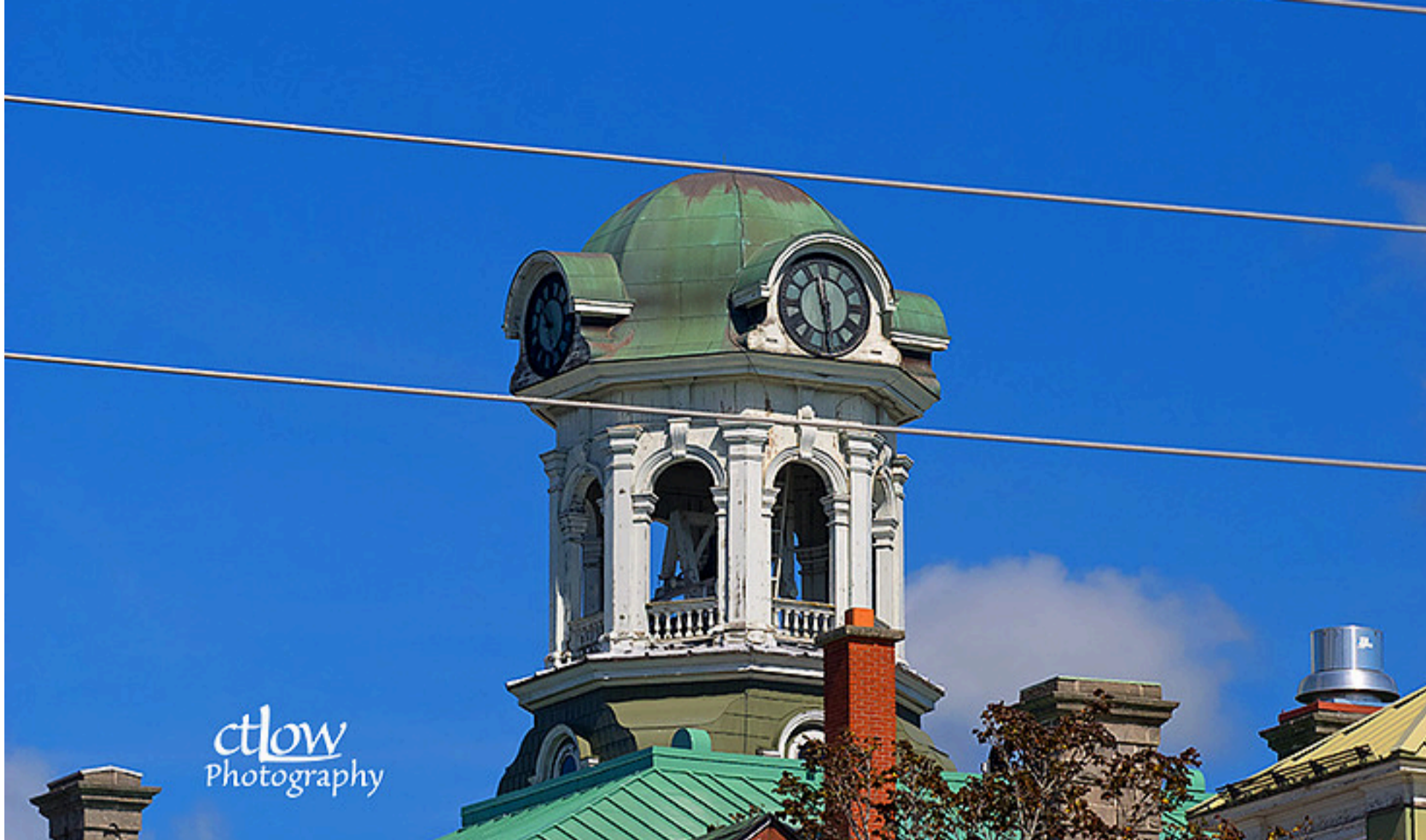
Brockville City Hall tower with wires

Such wires profoundly consternate urban photographers everywhere, and yet I suggest that, in this image, they constitute the actual subject, with the tower as the secondary visual accent.