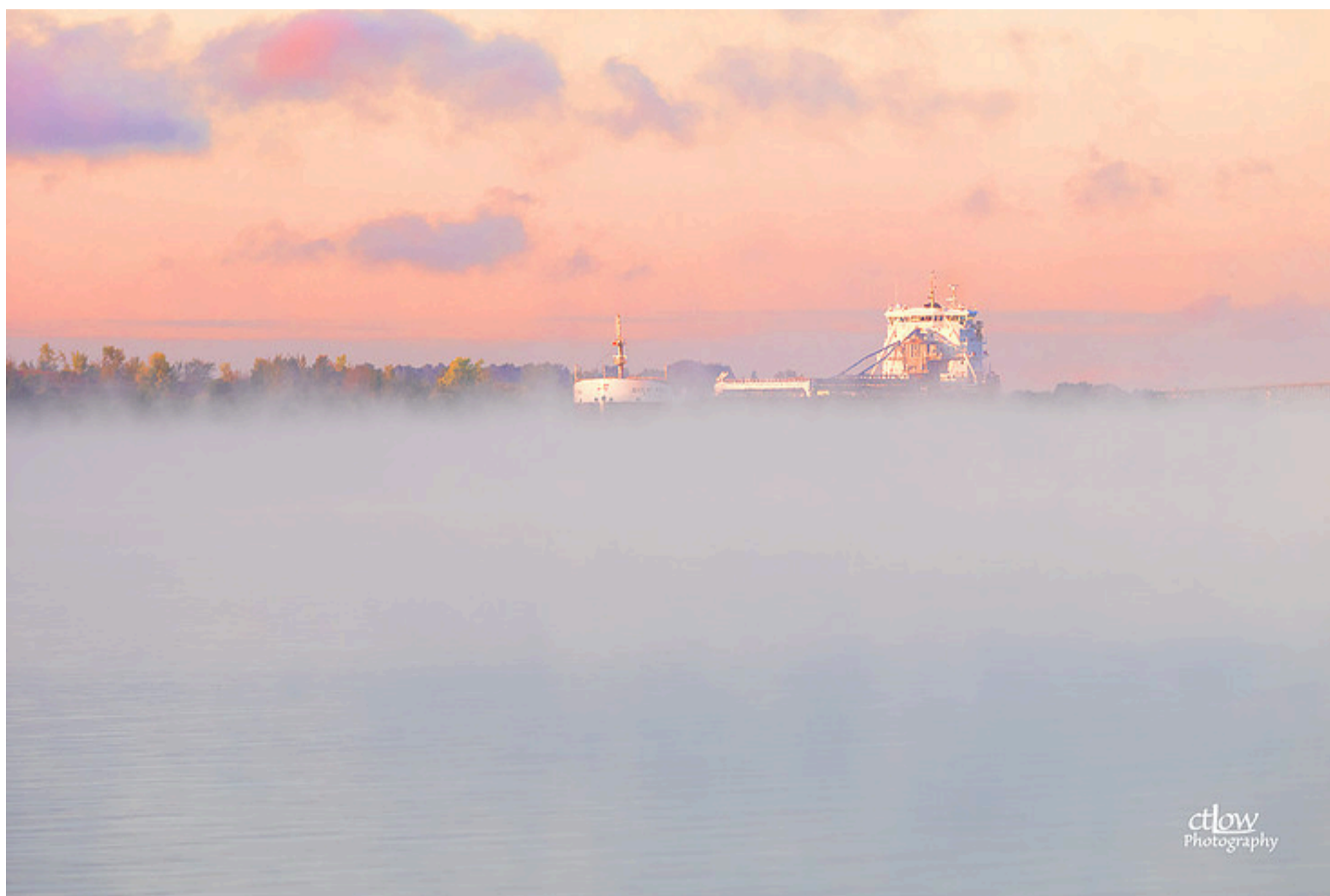
Freighter Baie St. Paul, Cardinal - foggy dawn

That brings us to this morning, at Cardinal , Ontario, at dawn.