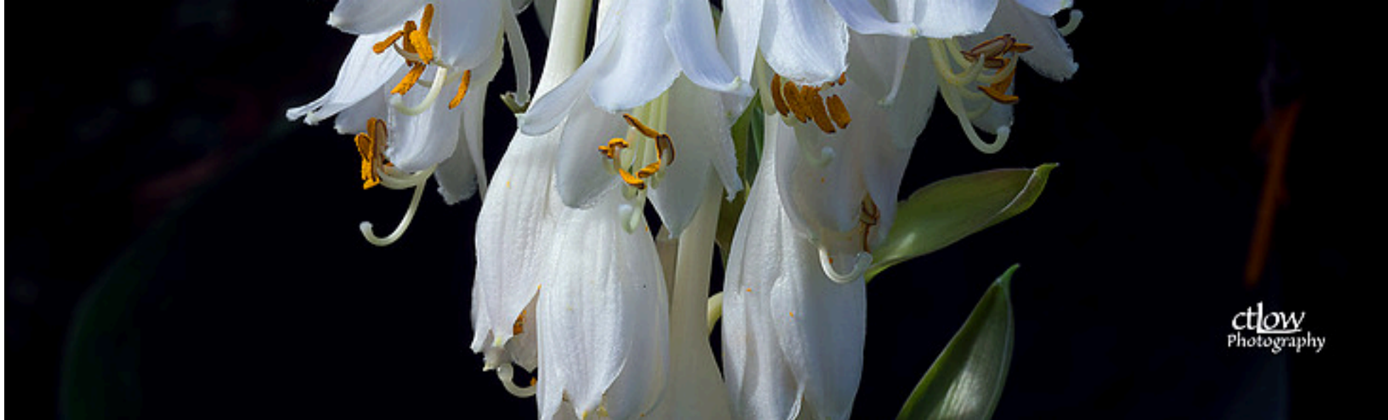
Hostas in bloom

Flowers have featured so prominently in art since like forever, and with good reason. I sometimes think "more flowers?", and then I photograph more flowers.