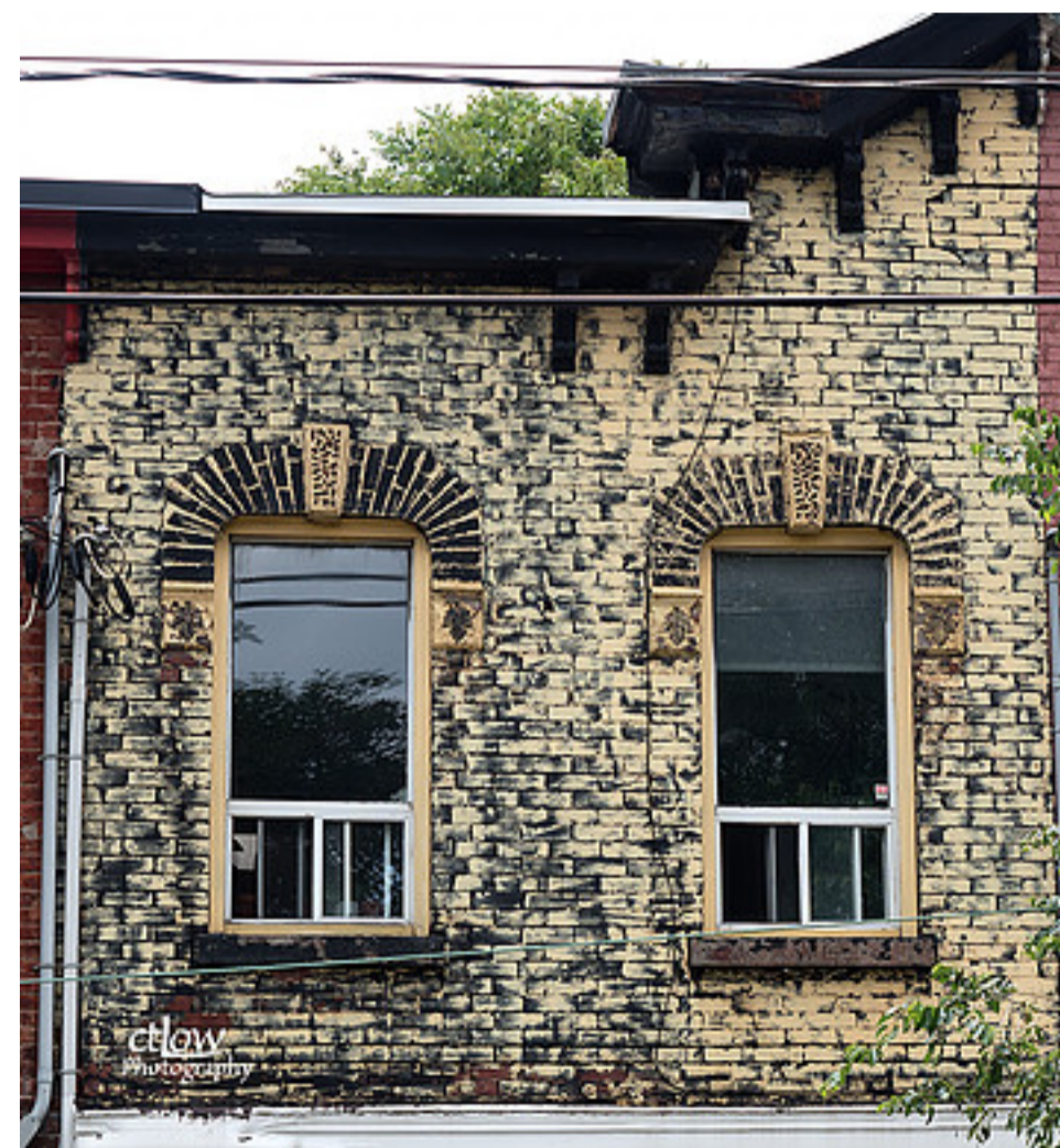
Somebody art-ed up this wall in Toronto

I essentially don't like and don't do Street Photography, but I'm showing the one below. I believe that the subject remains unidentifiable, which matters to me. She never knew that I was there, unlike the occasional photograph where I later find the subject boring a hole through me with their eyes - a little embarrassing, albeit in retrospect.