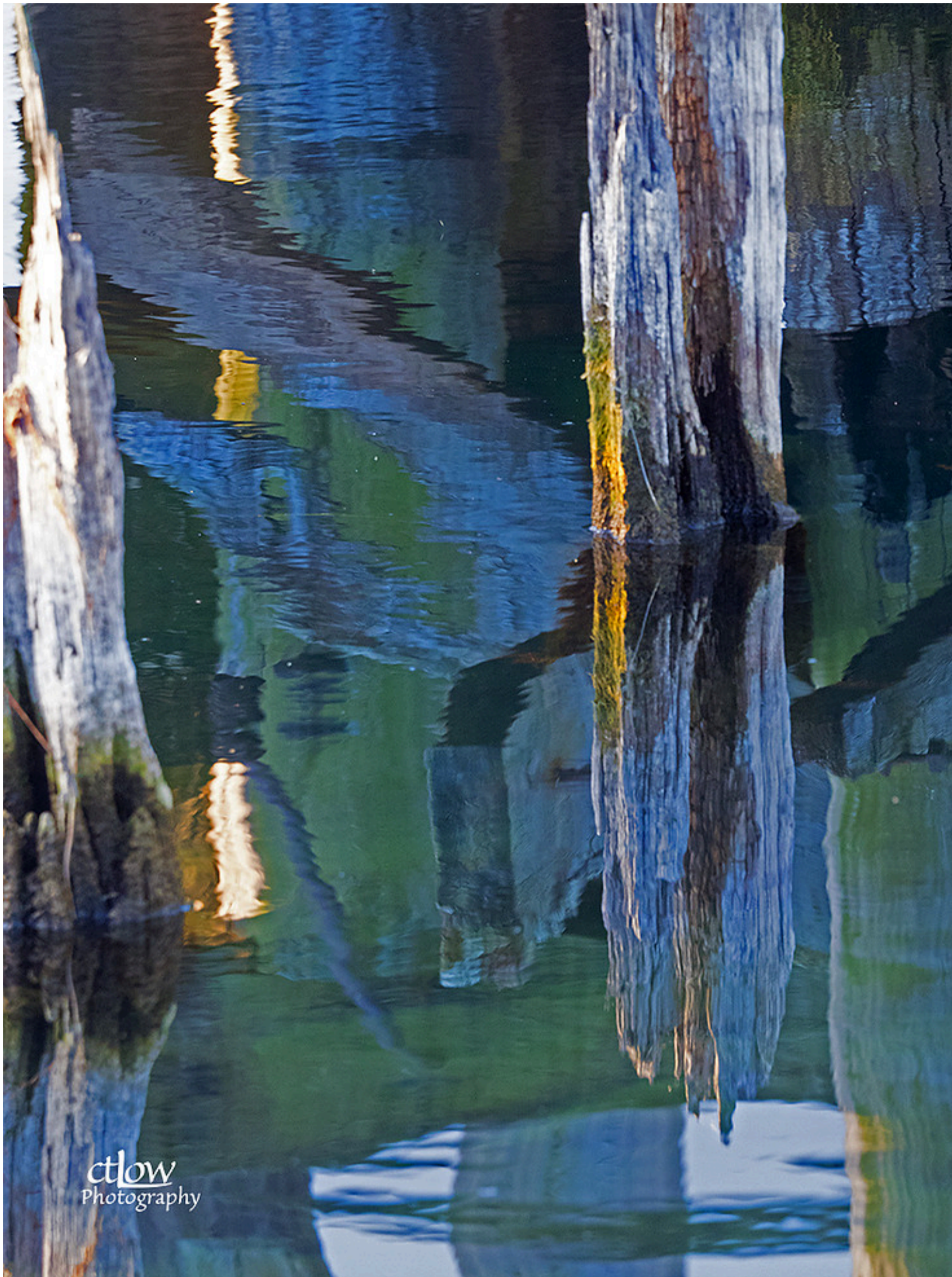
Reflection - Prescott pilings

I have made two previous visits, both times at dawn, one of them at a temperature of -16C, to photograph the ancient pilings just downstream from that beacon. This time, needing something fresh, I looked ... afresh, really just basically trying harder, more for details than vistas ... and located this interplay of reflections.