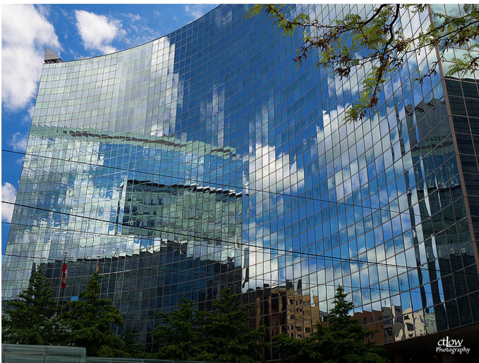
Ontario Power Building

My companions were endlessly patient with my photography, and for the image below I just had to walk twenty steps off our route to avoid some urban wires, and I snapped.