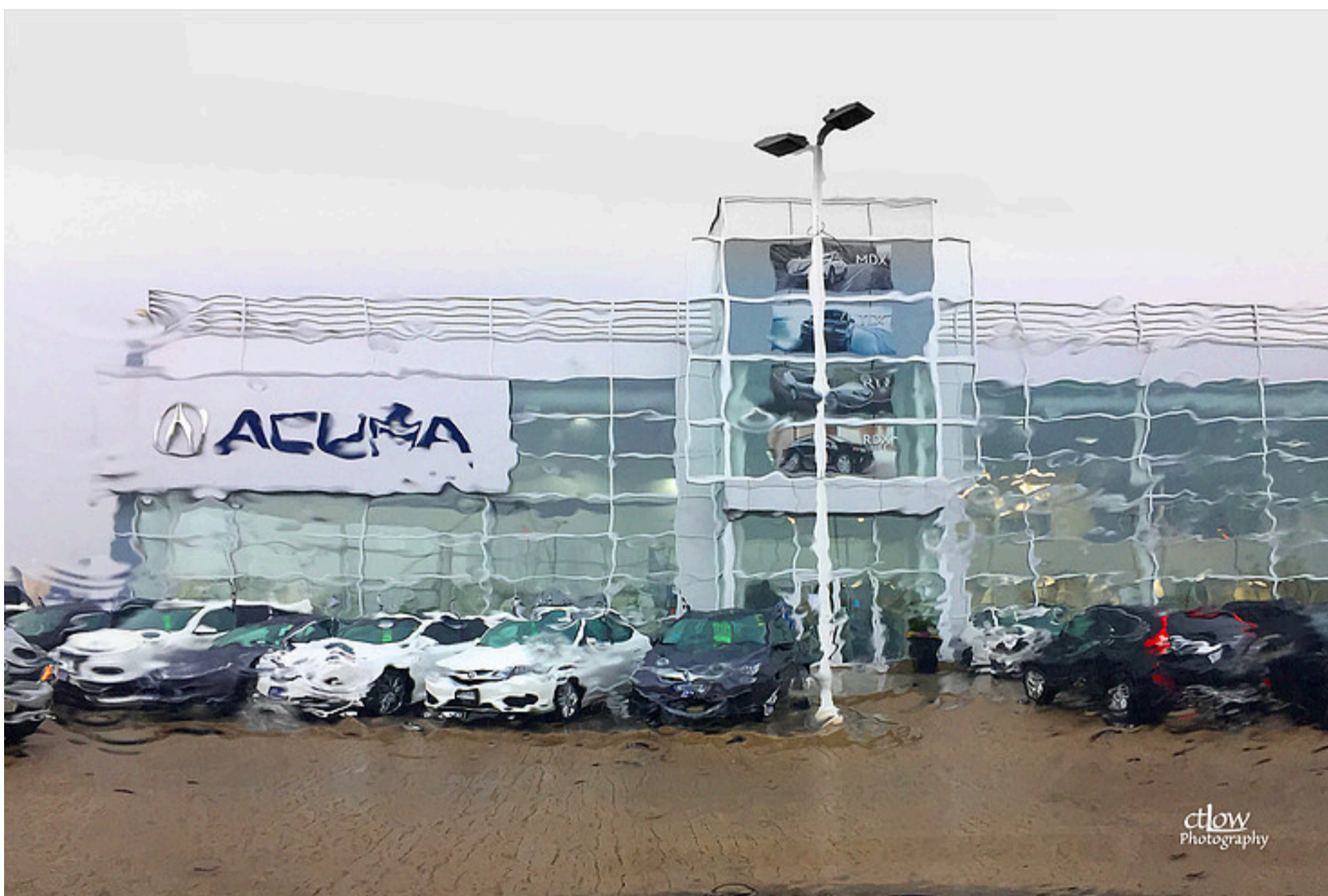
Maple Acura in the rain

Rolling into Maple Acura in Vaughn , far from home because I wanted a specific but scarce car, the skies opened and for a minute I dared not even exit the (soon-to-be-traded) vehicle. However, I whipped out my cellphone and shot a few frames through the windshield.